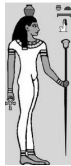
Nut- Egyptian Goddess of the Sky