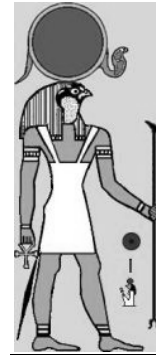
Ra- The Sun God