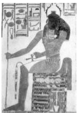
Khepri- Egyptian God of creation, movement of the Sun, rebirth (this god had the head of a fly).