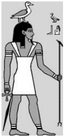
Geb- Egyptian God of the Earth (over the dust of the earth)