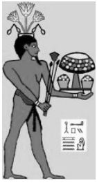
Hapi- Egyptian God of the Nile (a water bearer)