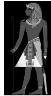
Pharaoh- The Ultimate Power of Egypt

Pharaoh, the king of Egypt, was worshipped by the Egyptians because he was considered to be the greatest Egyptian God of all. It was believed that he was actually the son of Ra himself, manifest in the flesh.