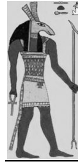
Seth- Egyptian God of Storms and Disorder