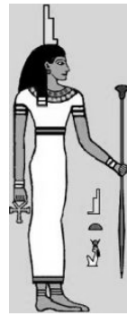
Isis- Egyptian Goddess of Medicine and Peace