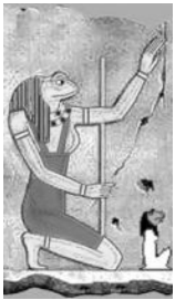
Heket- Egyptian Goddess of Fertility, Water, Renewal (note the head of the frog)